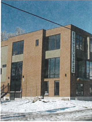
Primary Materials: Bricks