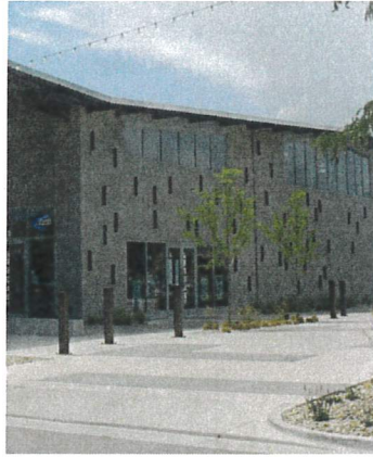
Primary Materials: Stone