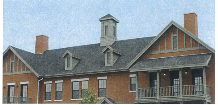
Roof Materials: Asphalt Composite Shingles