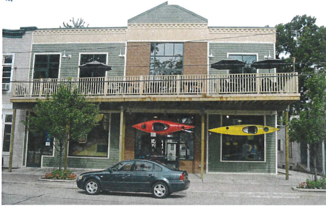
Primary Materials: Painted Wood